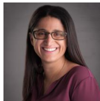
Mona Hanna-Attisha, MD, MPH, FAAP, Director of the Michigan State University and Hurley Children's Hospital Pediatric Public Health Initiative