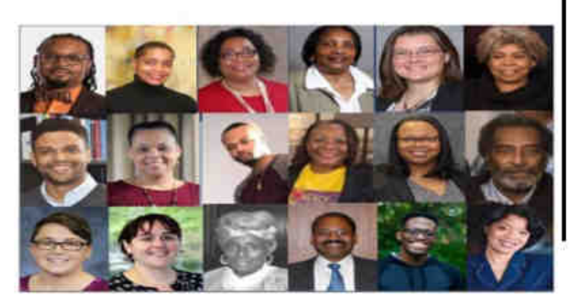
Trust Study: Flint Special Projects Steering Committee